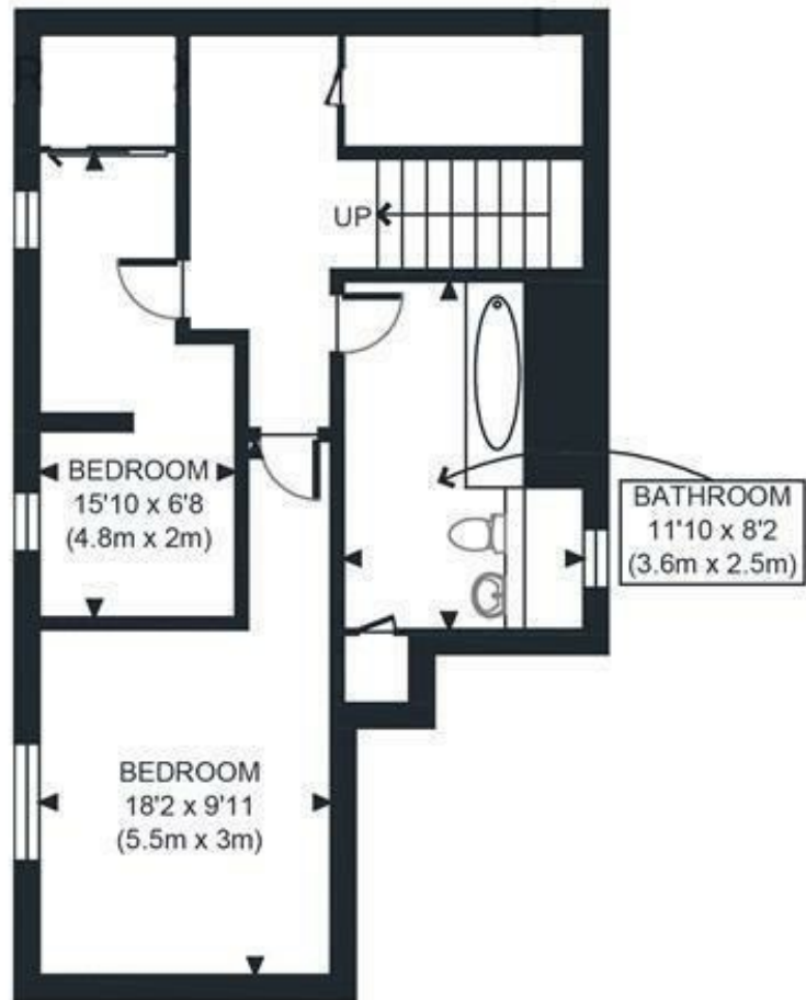
FOURTH FLOOR GROSS INTERNAL FLOOR AREA 498 SQ FT